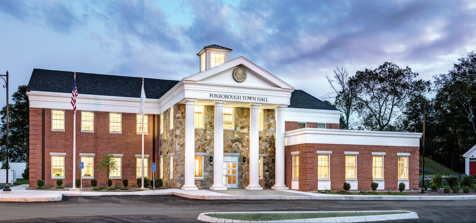
B.C. Construction Co., Inc. served as general contractor for the new Foxborough Town Hall in Foxborough, Massachusetts, which replaced the original town hall structure that was built in 1961.