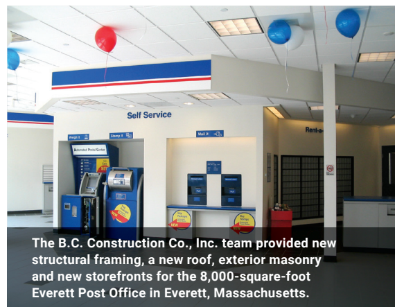
The B.C. Construction Co., Inc. team provided new structural framing, a new roof, exterior masonry and new storefronts for the 8,000-square-foot Everett Post Office in Everett, Massachusetts.